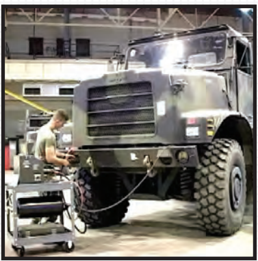
ONE PERSON OPERATION

When you need a light and brake check in extreme climates around the world you need LITE CHECK!