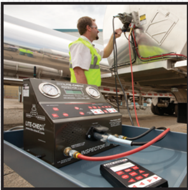
NO TRACTOR REQUIRED 1 TECHNICIAN OPERATION

If CSA and DOT inspections are affecting your fleet records implement the INSPECTOR 910B and clean up your scores. When you need a light, brake, and ABS test, you need LITE-CHECK!