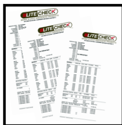
DETAILED CUSTOM PRINTED REPORTS