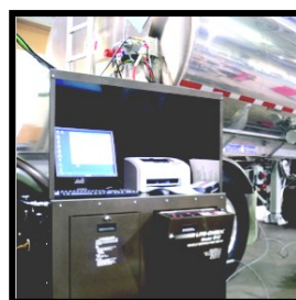
TEST AND CERTIFY SIMULTANEOUSLY